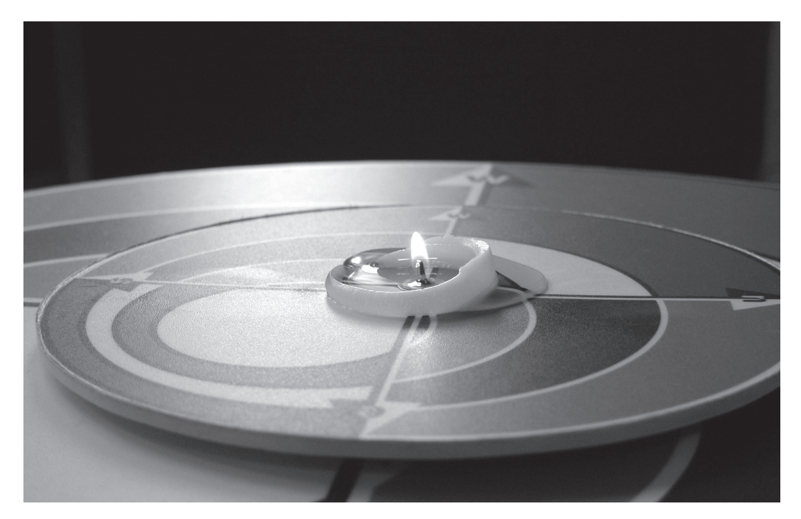
■ Game image: World Telekinesis Competition. Noxious Sector Arts Collective. Color photograph, 2010.

experiment; less a claim of ability and more a gamble with possibility. There are other rules, too, but they are more recommendations than prohibitions.